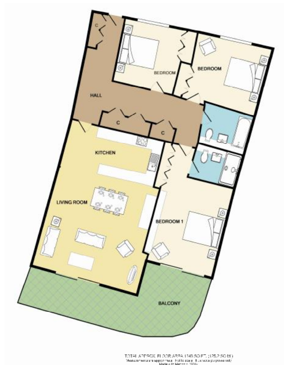
Apartment 14 – Level 3 £625,000